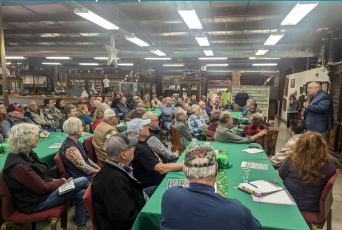
Documentary film premiere, Belleville