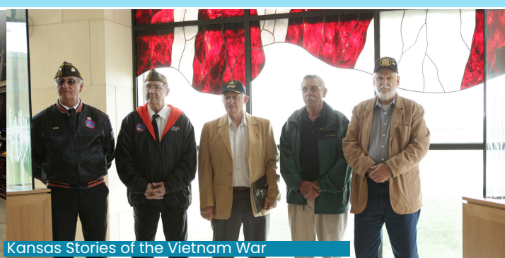
Speakers Bureau, Park City